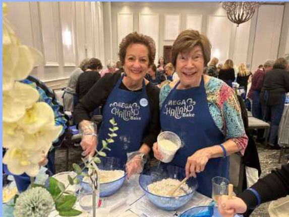
TBE Ladies go to the Mega Challah bake!